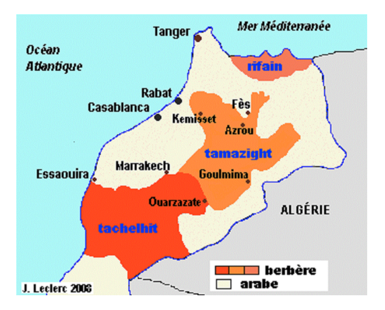
Figure 3.1: Amazigh dialects in Morocco (Map of Berber and Arab Morocco, 2009–2015)

"Amazigh" refers to the group of so-called indigenous people that inhabit parts of Morocco, Algeria and adjoining parts of the Sahel. In Morocco, estimates vary but many figures show that the Amazigh make up approximately 30-40% of the population (around 15 million), which is the largest percentage of any country in North Africa (Ennaji 2005; Institut Royal de la Culture Amazighe 2011; Zouhir 2014; El Aissati, Karsmakers and Kurvers 2011). Within Morocco there exist three predominant groups of Amazigh: Tashelhit in the southern desert regions; Tamazight in the central plains; and Tarifit in the northern Rif mountains (see Figure 3.1). All three speak different varieties of the Amazigh language, which are often unintelligible to one another (Sadiqi 2011). Based on personal observation within the country, many other groups exist from region to region, and even village to village. They wear different clothing, perform different rituals, live off the land differently and have their own traditions. This shows how languages do not exist prior to an individual's shared life and mode of living; rather, languages are a product of social and historical practices.